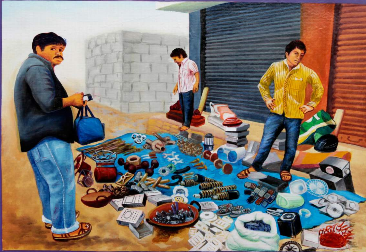
Handmade Aircraft in Bangalore