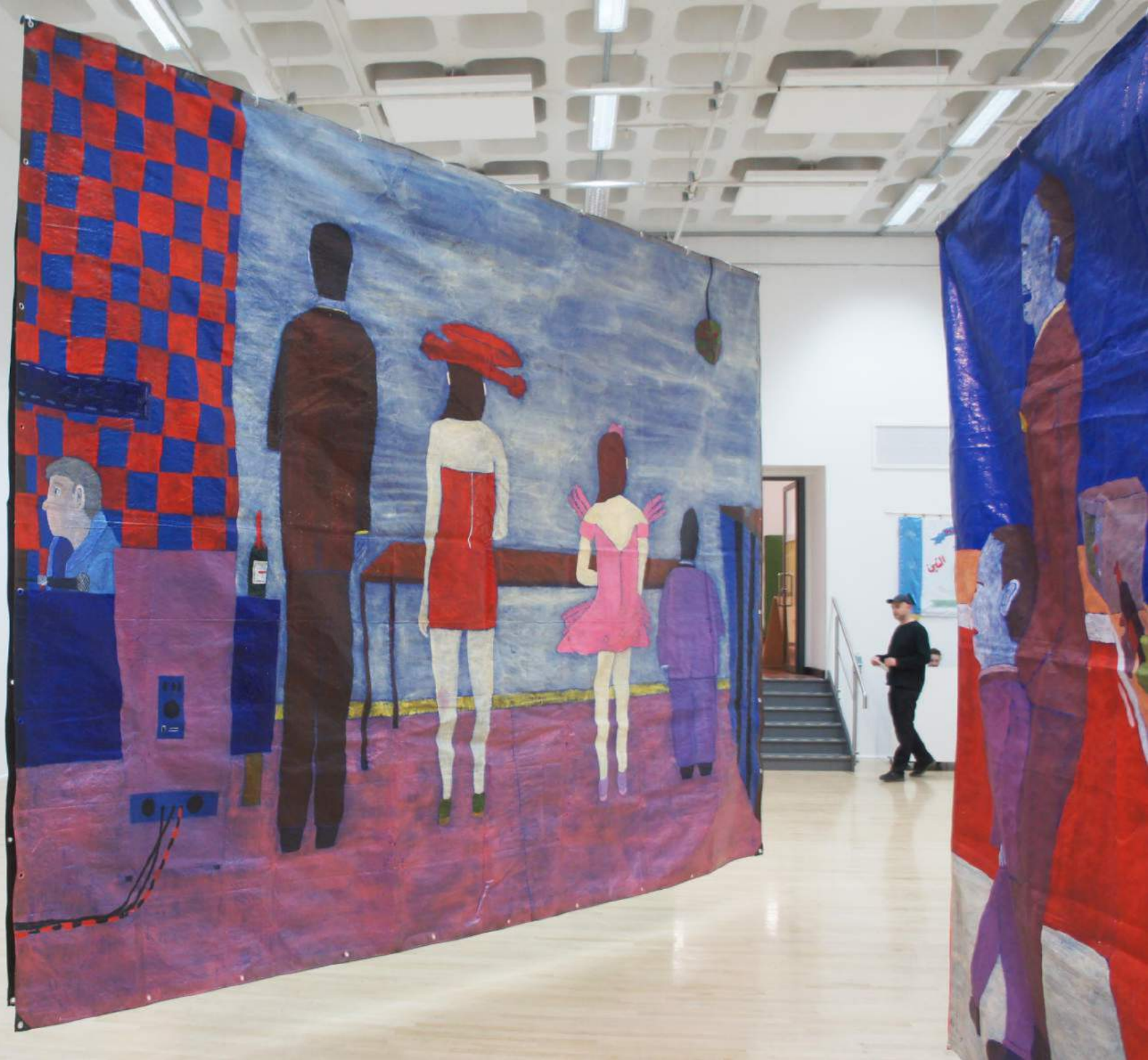
Installation view of Double Date acrylic paint on tarpaulin 350 x 500cm, 2018