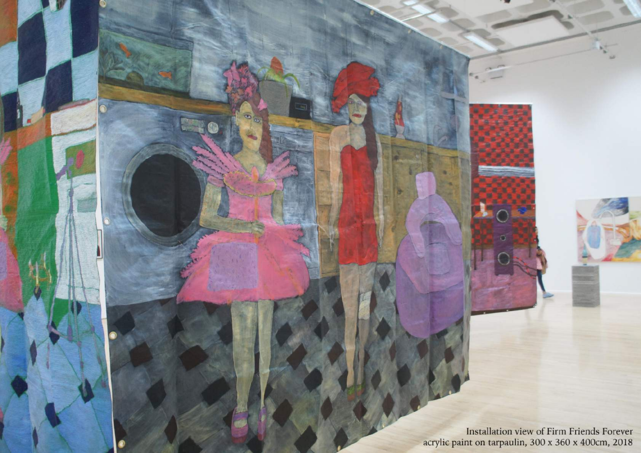
Installation view of Firm Friends Forever acrylic paint on tarpaulin, 300 x 360 x 400cm, 2018