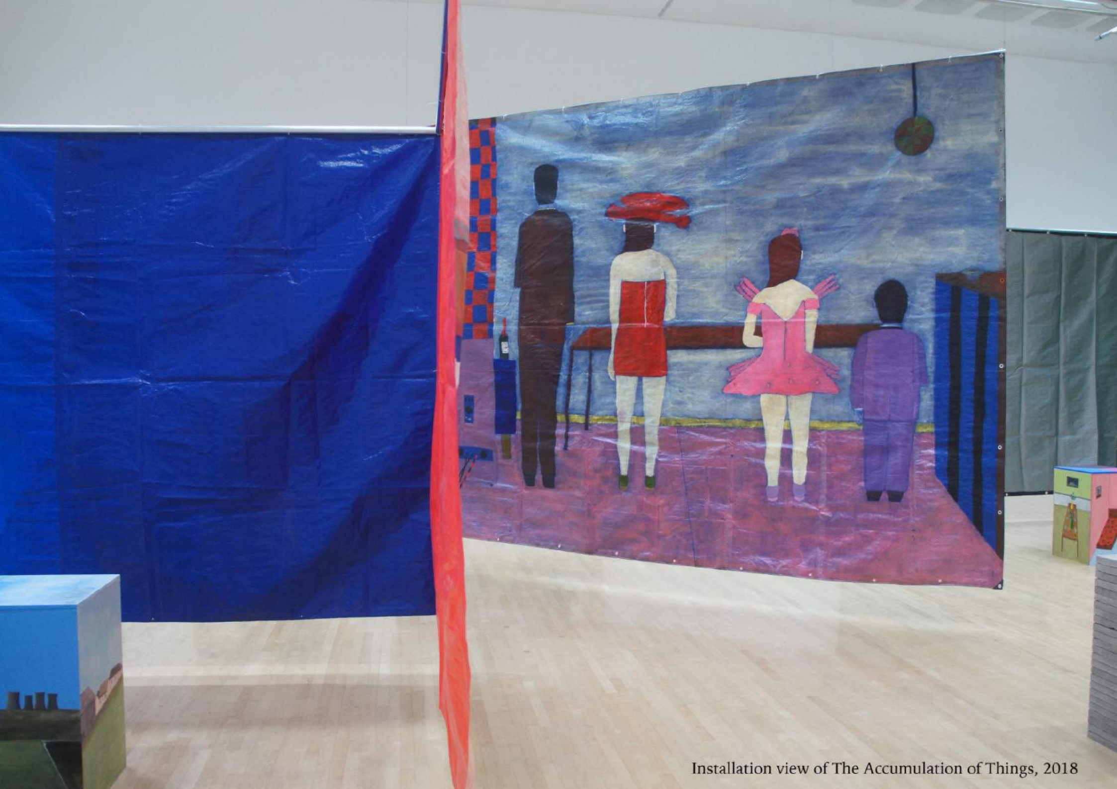
Installation view of The Accumulation of Things , 2018