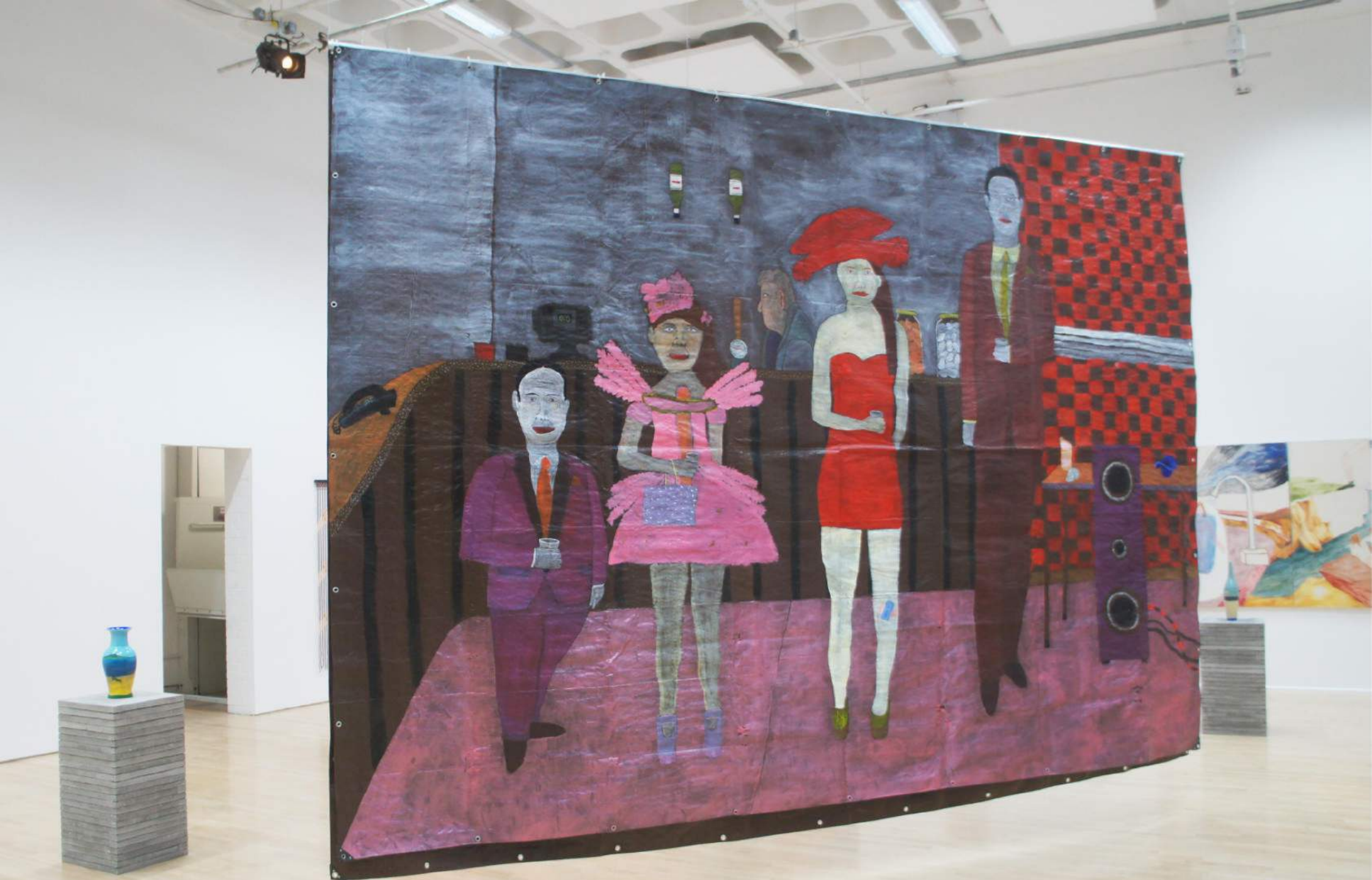
Installation view of Double Date, acrylic paint on tarpaulin, 350 x 500cm, 2018