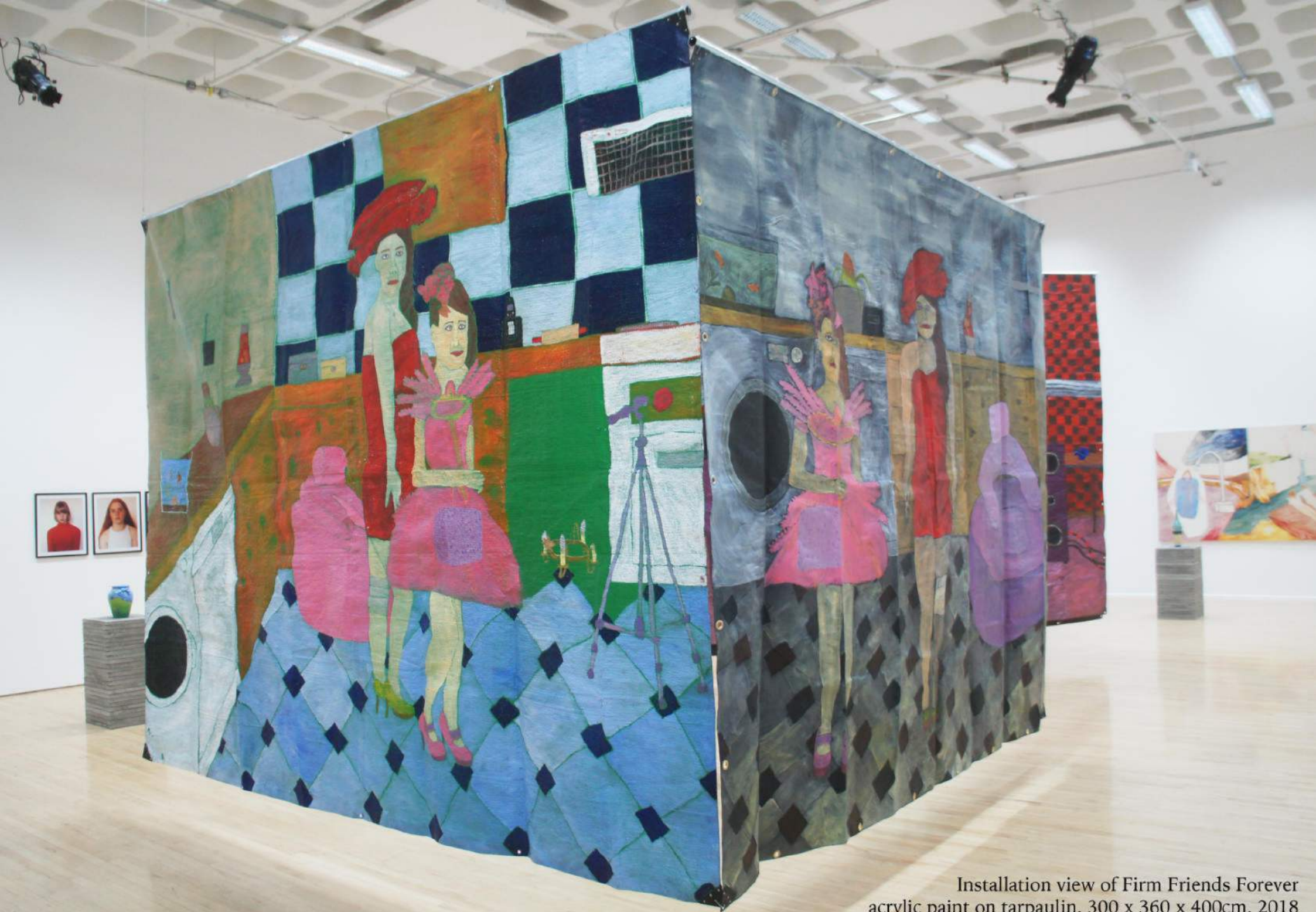
Installation view of Firm Friends Forever acrylic paint on tarpaulin, 300 x 360 x 400cm, 2018