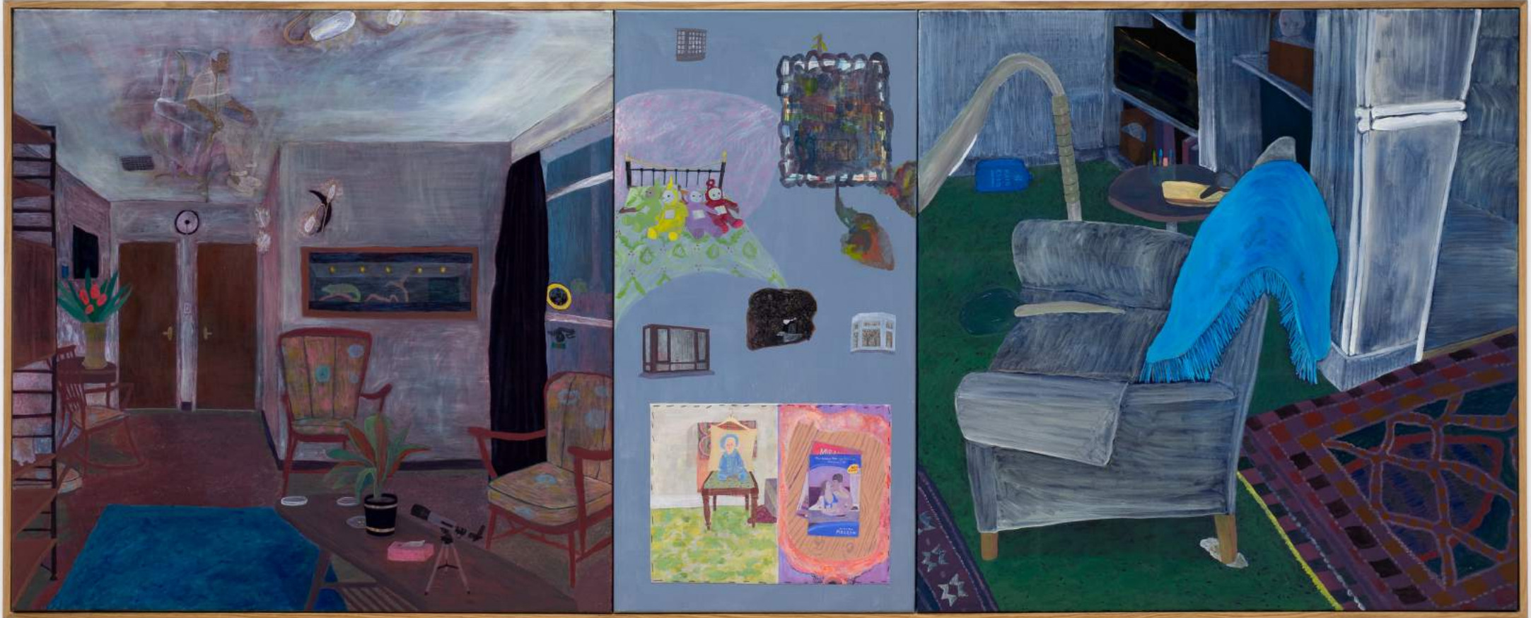
Triptych with Blue Rug, oil and acrylic paint on canvas, oak frame, 100 x 250cm, 2018