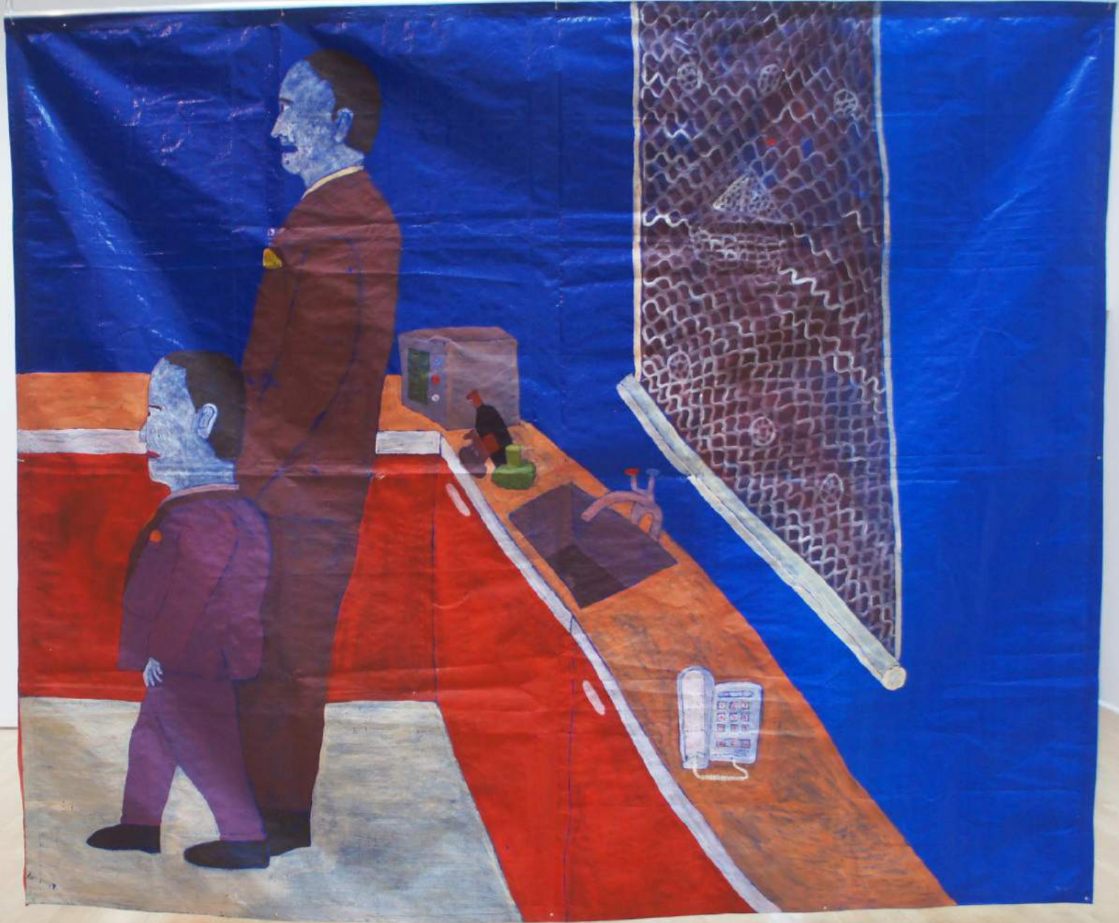
Installation view of Firm Friends, acrylic paint on tarpaulin, 265 x 286 x 322cm, 2018