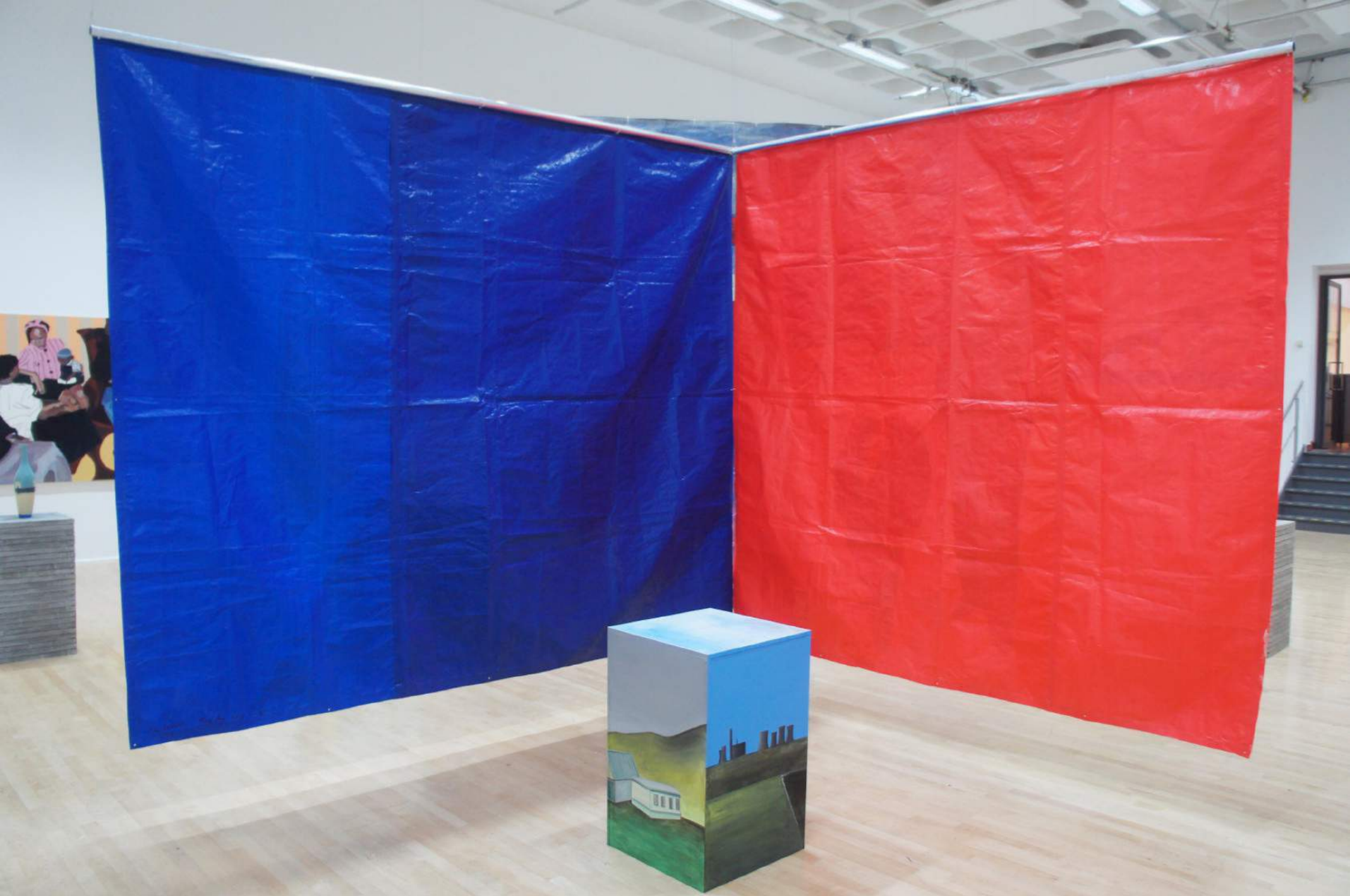
Installation view of Firm Friends with sculpture by Evie O'Connor in foreground, acrylic paint on tarpaulin, 265 x 286 x 322cm, 2018