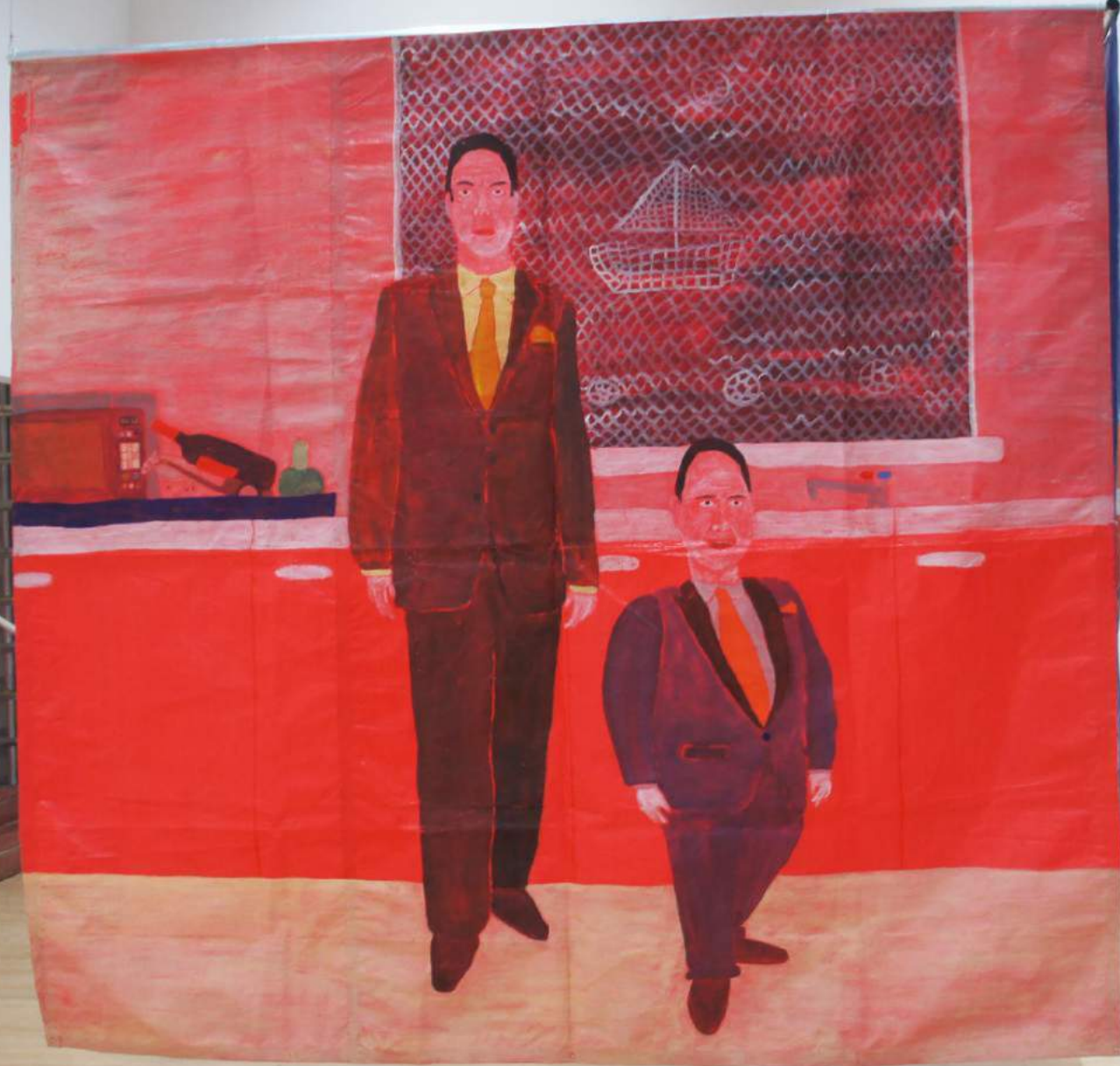
Installation view of Firm Friends, acrylic paint on tarpaulin, 265 x 286 x 322cm, 2018