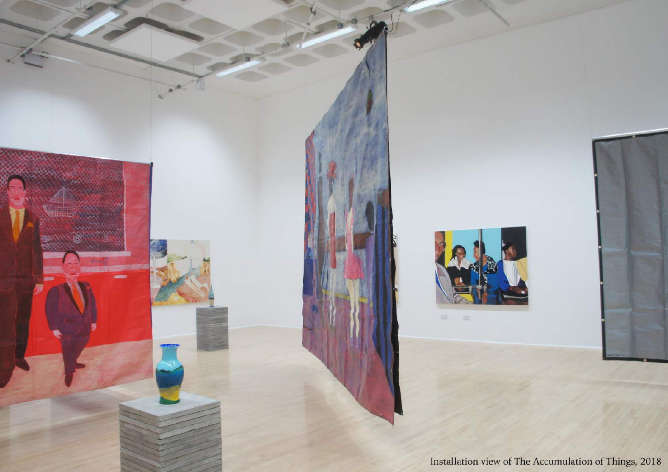
Installation view of The Accumulation of Things , 2018